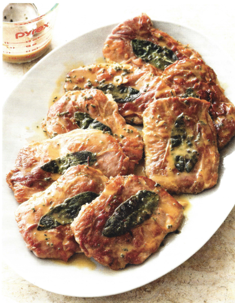
Minced fresh sage in the sauce reinforces the floral, piney pop of the whole sage leaves.

4. Add remaining 1 tablespoon oil to now-empty skillet and heat over medium-high heat until shimmering. Add garlic and minced sage and cook until fragrant, about 30 seconds. Stir in broth and wine and simmer until reduced to ½ cup, 5 to 7 minutes, scraping up any browned bits. Reduce heat to low and whisk in butter, 1 piece at a time. Stir in lemon juice and any accumulated meat juices from platter. Season with salt and pepper to taste. Spoon sauce over pork and serve.