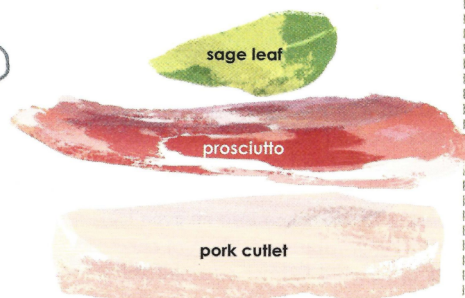
STACK AND POUND